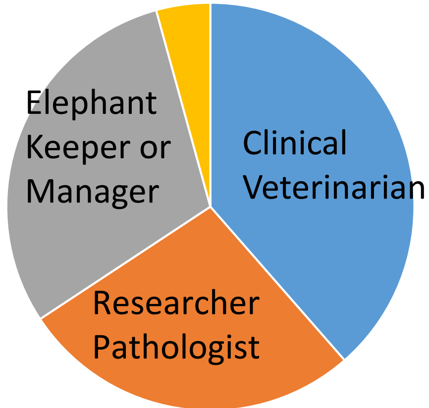
ZSL 2017 (total 70)